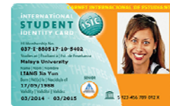
ISIC-HI Cobrand Card

Check out the Hostelling International at the website: www.hihostels.com for hostels all over the world and online reservations.