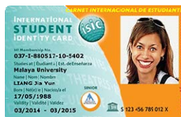
ISIC-HI Cobrand Card – Two benefits in one card