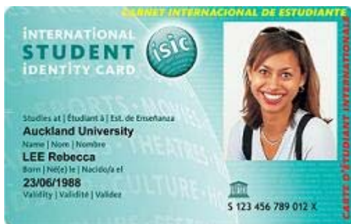
International Student Identity Card ..... your student lifestyle card

Voopee - A great way to keep in touch with your family and friends while abroad.