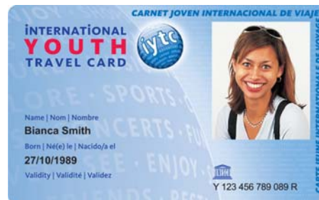
International Youth Travel Card

Check out the IYTC at the website: www.isic.org