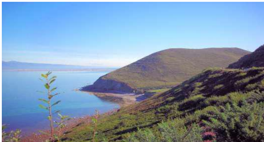
Ring of Kerry, County Kerry